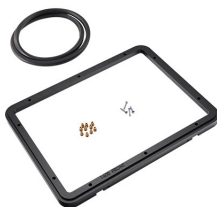
1400PF Special Application Panel Frame