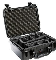
1454 With Padded Dividers