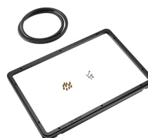
1450PF Special Application Panel Frame