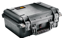
1450NF No Foam