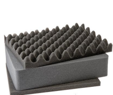
1451 3 pc. Replacement Foam Set

Master Pack 4 Nameplate yes Military yes