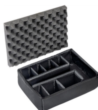
1455 Padded Divider Set