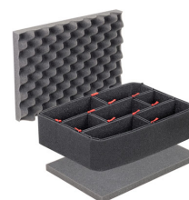
1450TPKIT TrekPak Case Divider Kit