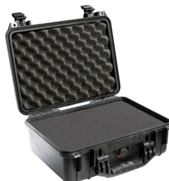
1450WF With Foam