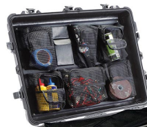
1639 Lid Organizer