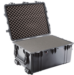
1630WF With Foam