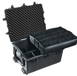
1634 With Padded Dividers