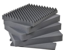
1631 5 pc. Replacement Foam Set