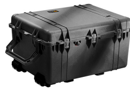
1630NF No Foam