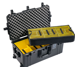
1626WD With Padded Dividers