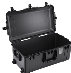
1626NF No Foam