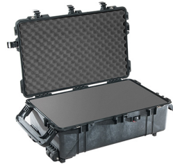
1670WF With Foam