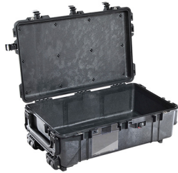
1670NF No Foam