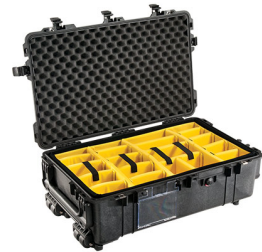
1674 With Padded Dividers