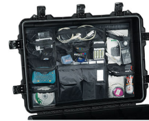
iM3075-UTILITYORG Utility Organizer