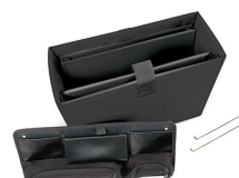
1436 Office Divider Kit