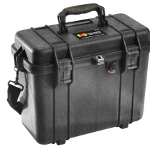
1430NF No Foam