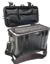
1434 With Padded Dividers & Lid Organizer