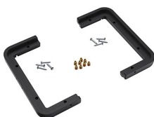
1430PF Special Application Panel Frame