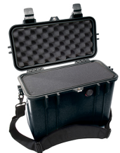
1430WF With Foam