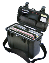
1437 With Padded Office Divider Set & Lid Organizer