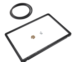
1520PF Special Application Panel Frame