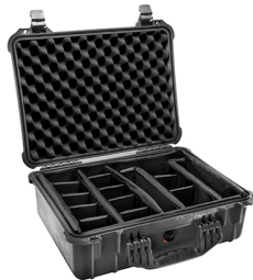
1524 With Padded Dividers