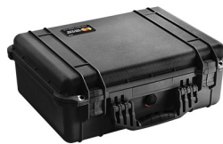
1520NF No Foam