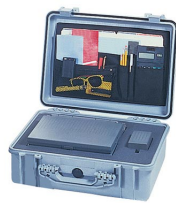
1509 Lid Organizer