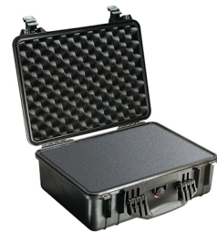
1520WF With Foam