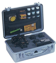
1508 Photographer's Lid Organizer