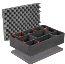
1520TPKIT TrekPak Case Divider Kit