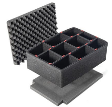
1500TPKIT TrekPak Case Divider Kit