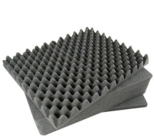
1501 3 pc. Replacement Foam Set