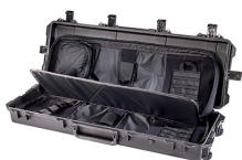
472-PWC-DW3200-BLK-BLK Black Case With Black Soft Case