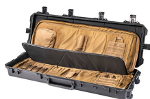
472-PWC-DW3200-BLK-COY Black Case With Coyote Soft Case