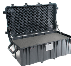
0550WF With Foam