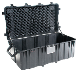
0550NF No Foam