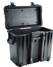
1440NF No Foam