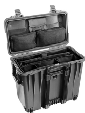
1447 With Padded Office Divider Set & Lid Organizer