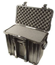
1440WF With Foam