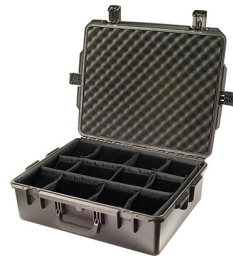
iM2700-X0002 With Padded Dividers