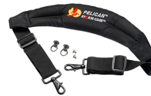
iM-STRAP-S-VER2 Padded Shoulder Strap