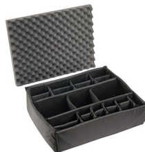
iM2700-DIV Padded Divider Set