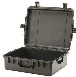
iM2700-X0000 No Foam