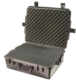
iM2700-X0001 With Foam