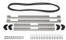
iM2700-M4-BEZEL-L Lid Bezel Kit (Metric)