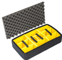
1555AirDS Padded Divider Set