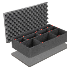
1555TPKIT TrekPak Case Divider Kit