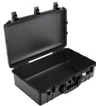
1555NF No Foam