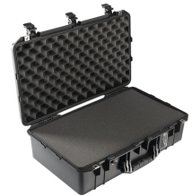
1555WF With Foam