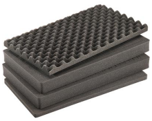
1555AirFS 4 pc. Replacement Foam Set