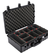
1555TP With TrekPak Divider System