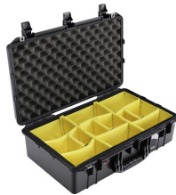
1555WD With Padded Dividers