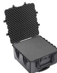
1640WF With Foam