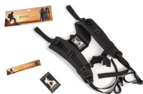
RucPac-normal RucPac Standard Hardcase Backpack Conversion

c/ Provença, 388, Planta 7 • Barcelona, Spain 08025 • Phone: +34 934 674 999 info@peli.com • www.peli.com