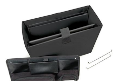
1436 Office Divider Kit