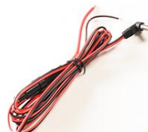
6061F Direct Wiring Rig for Fast Charger