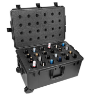
WINE-24B 24-Bottle Wine