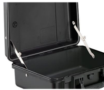
iM-LIDSTAY Lid Stay