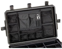
iM29XX-UTILITYORG Utility Organizer