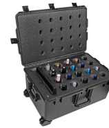
WINE-20B 20-Bottle Wine