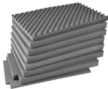
iM2975-FOAM 8 pc. Replacement Foam Set