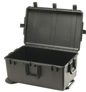
iM2975-X0000 No Foam