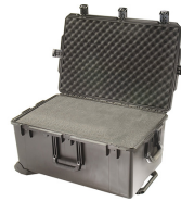
iM2975-X0001 With Foam