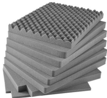
iM2750-FOAM 8 pc. Replacement Foam Set