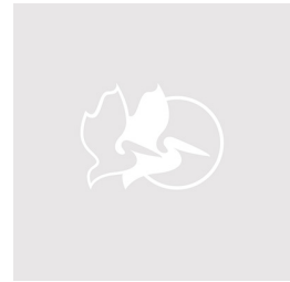
AL3424-0805RPFC With Foam, With Casters