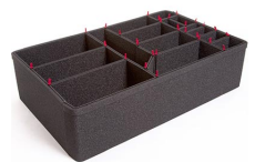
1650EUTP TrekPak Case Divider Kit