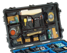
1659 Photo/Lid Organizer