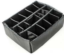
1615 Padded Divider Set