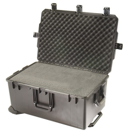
iM2975-X0001 With Foam