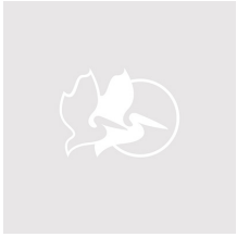
IM27XX-M4-BEZEL-L Lid Bezel (Metric)