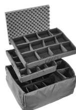
iM2750-DIV Padded Divider Set