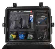
iM27XX-UTILITYORG Utility Organizer