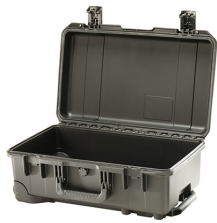
iM2500-X0000 No Foam