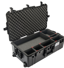
1615TP With TrekPak Divider System