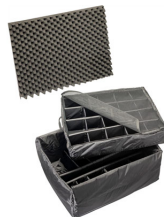
1695 Padded Divider Set