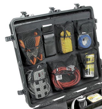
1699 Lid Organizer