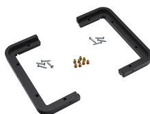
1430PF Special Application Panel Frame