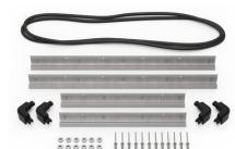
iM2620-M4-BEZEL Base Bezel Kit (Metric)