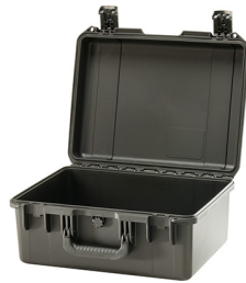
iM2450-X0000 No Foam