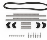
iM2306-M4-BEZEL-L Lid Bezel Kit (Metric)