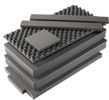
1615AirFS 7 pc. Replacement Foam Set