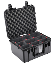
1507TP With TrekPak Divider System