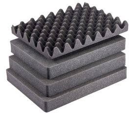
1507AirFS 5 pc. Replacement Foam Set