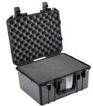
1507WF With Foam