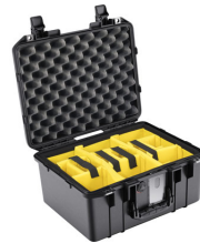
1507WD With Padded Dividers