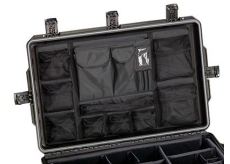
iM29XX-UTILITYORG Utility Organizer