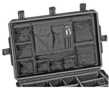
iM2875-UTILITYORG Utility Organizer