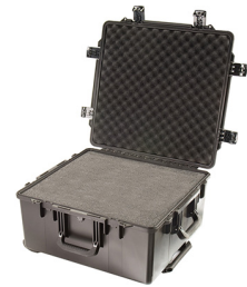
iM2875-X0001 With Foam