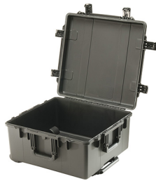
iM2875-X0000 No Foam