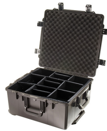
iM2875-X0002 With Padded Dividers