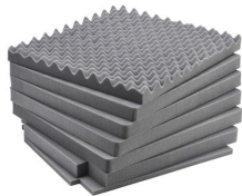
iM2875-FOAM 7 pc. Replacement Foam Set