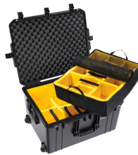
1637WD With Padded Dividers