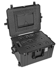
WINE-12B 12-Bottle Wine