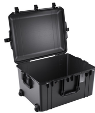
1637NF No Foam