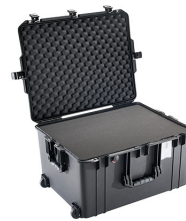
1637WF With Foam