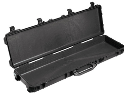
1750NF No Foam