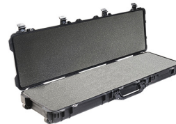
1750WF With Foam