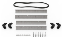
iM2275-MBEZ-B Base Bezel Kit (Metric)