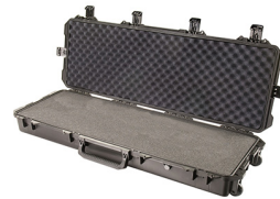
iM3200-X0001 With Foam