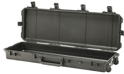
iM3200-X0000 No Foam