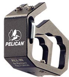
0782 Helmet Light Holder