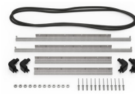
iM2620-M4-BEZEL-L Lid Bezel Kit (Metric)