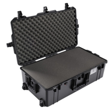
1615WF With Foam