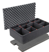
1615TPKIT TrekPak Case Divider Kit