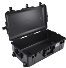
1615NF No Foam