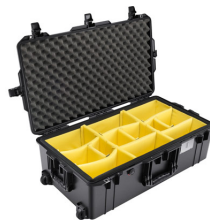
1615WD With Padded Dividers