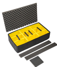
1615AirDS Padded Divider Set