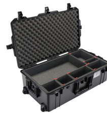
1615TP With TrekPak Divider System