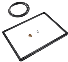
1550PF Special Application Panel Frame