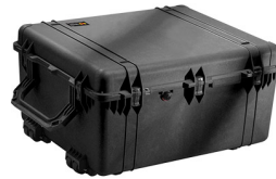
1690NF No Foam