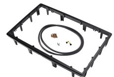
1490PF Special Application Panel Frame