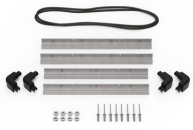
iM2275-M4-BEZEL-L Lid Bezel Kit (Metric)