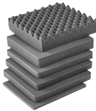
iM2275-FOAM 4 pc. Replacement Foam Set