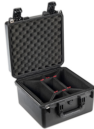
iM2275-X0006 With TrekPak Divider System