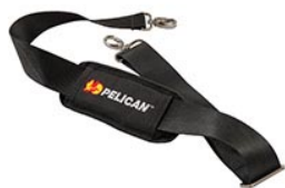
9487 Padded Shoulder Strap