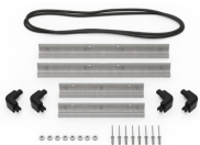
iM2200-MBEZ-B Base Bezel Kit (Metric)