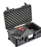
1535AIRTPF TrekPak / Foam Hybrid